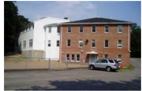
1997 Addition (white structure)