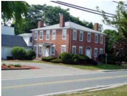
1993 Mechanicals updated